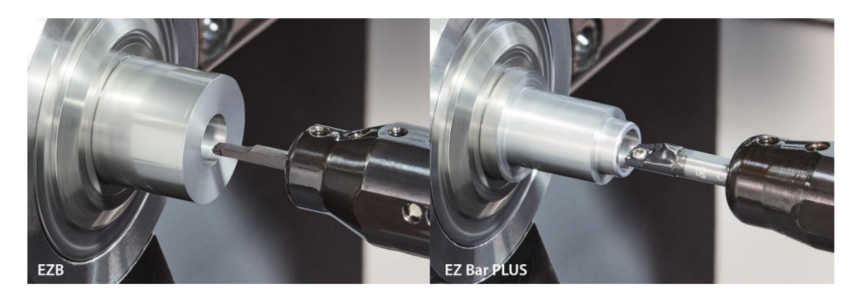
EZ Bar and EZ Bar Plus during machining processes

For great boring and back turning results chip breaker, neck length and grade can be selected for the individual purpose – even PCD and cBN are available. Also suitable for boring is the EZ Bar Plus, a reversible boring bar that offers a unique solution to minimise tooling costs. This indexable bar can perform boring processes with a minimum cutting diameter of 5 mm.